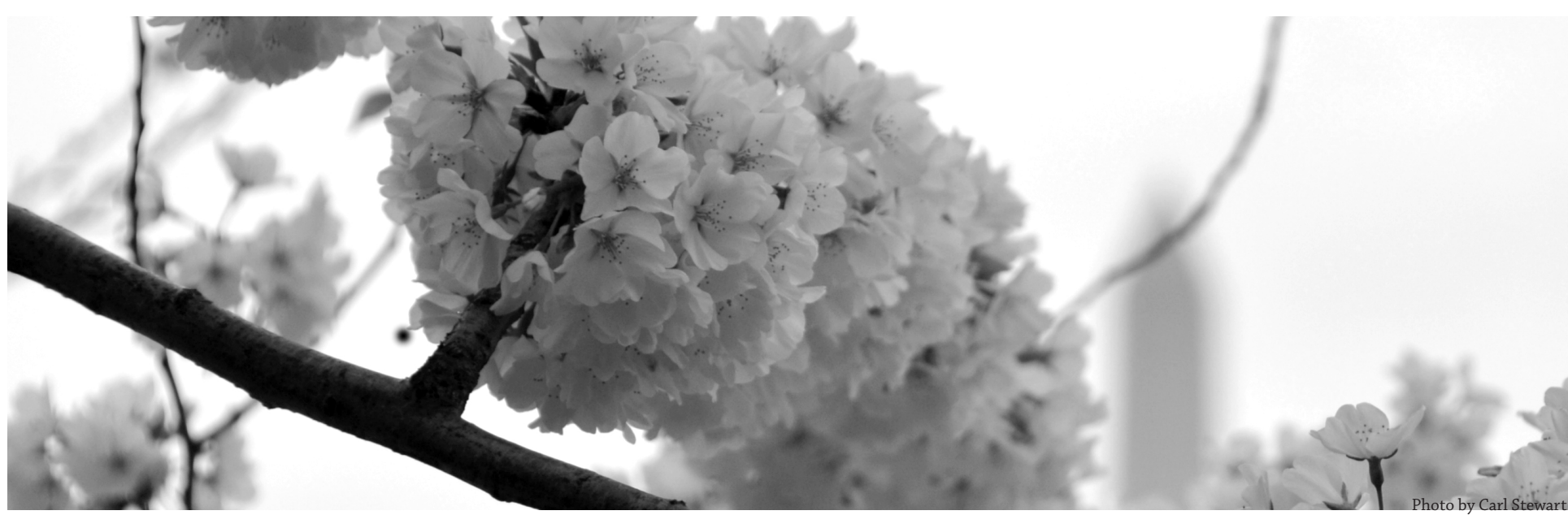
DC GOES PINK - Cherry blossoms show off the first signs of spring. Every year, thousands of people flock to DC to see the trees, which were given to the U.S. as a gift from Japan in 1910.